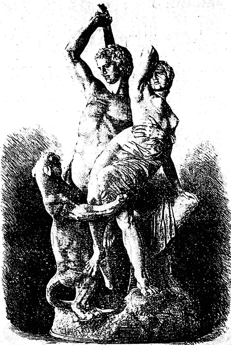
PINTHOUS AND THE PANTHER. FROM A STATUE IN THE MUNICH GALLERY.

RAND McNALLY'S MAP OF ONTARIO, WITH Index, accurately locating on the Map Counties, Islands, Lakes, Rivers, Post Offices, Railroad Stations, and all Towns, &c. Paper, 40c.; cloth, 60c., mailed. CLOUGH BROS., Booksellers, Toronto.