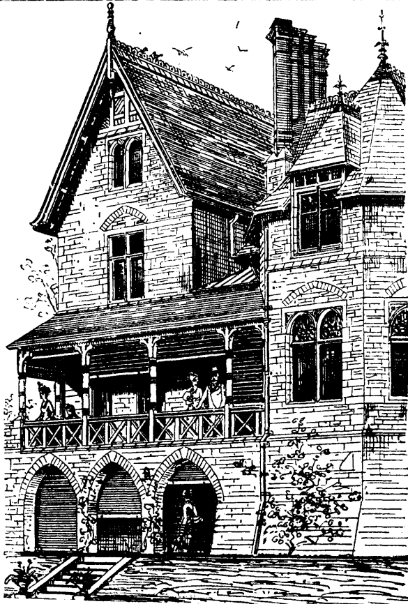
Fig. 1.—Application of the Self-Coiling Venetian Shutters.