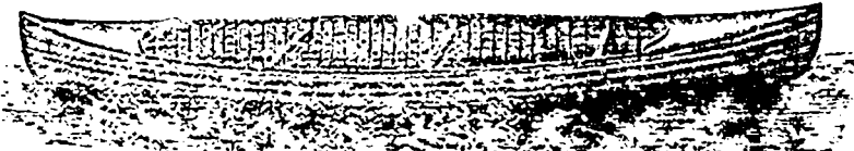
PATENT LONGITUDINAL RIB CANOE.

Patent Cedar Rib Canoes, Patent Longitudinal Rib Canoes, Basswood Canoes, Folding Canoes, Paddles, Oars, Tents, and all Canoe Fittings.