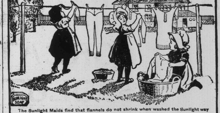
The Sunlight Maids find that flannels do not shrink when washed the Sunlight way