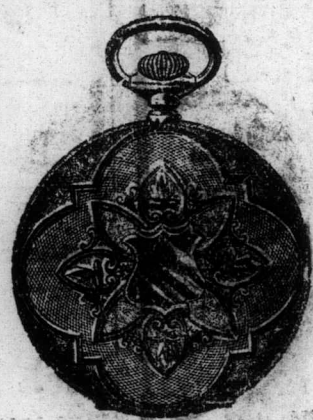
On Exhibition at BULLER BROS. and NEW- MAN AND SONS' Jewelry Stores.