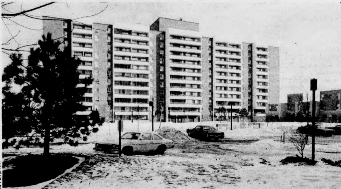
Part of Cadillac-Fairview's immense University City housing complex, just south of the York campus.

"The lady behind the desk said 'Are you students?' I said 'Yes' and she said, 'Oh, we don't rent to students'. So I said, 'How come you have so many students here then?' She answered 'Well the only possible way, after we screen you and make sure everything is okay, is that if all of your parents sign as guarantors.' So I said, 'Okay,