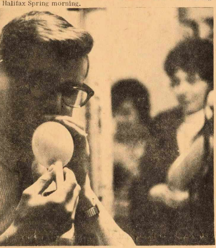
Dal students prepare decorations for Board of Governors meeting

Dalhousie student admires scenic Bedford Basin on a brisk