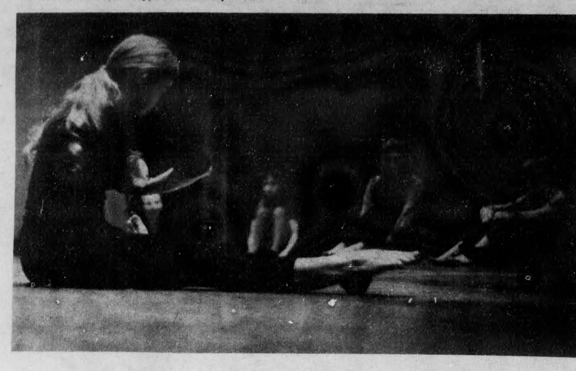
14 brunswickan, friday, november 7, 1969

Concentration is the keynote in these exercises by members of the Drama Festival Workshop in Memorial Hall.