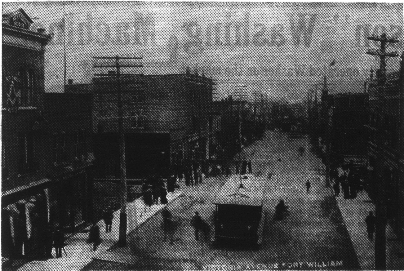
VICTORIA AVENUE, FORT WILLIAM, ONT., IN 1904.