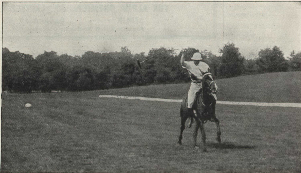
FROM 1A SPEED KODAK NEGATIVE