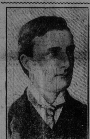
SIR EDWARD GREY,

Whose house was damaged in Suffragette onslaught.