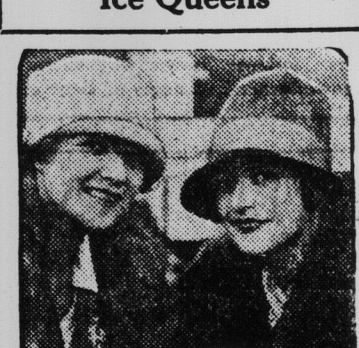
Girl skating champions of European cities have reached New York to begin a tour of America. This shows Miss Stockholm (left) and Miss Paris.