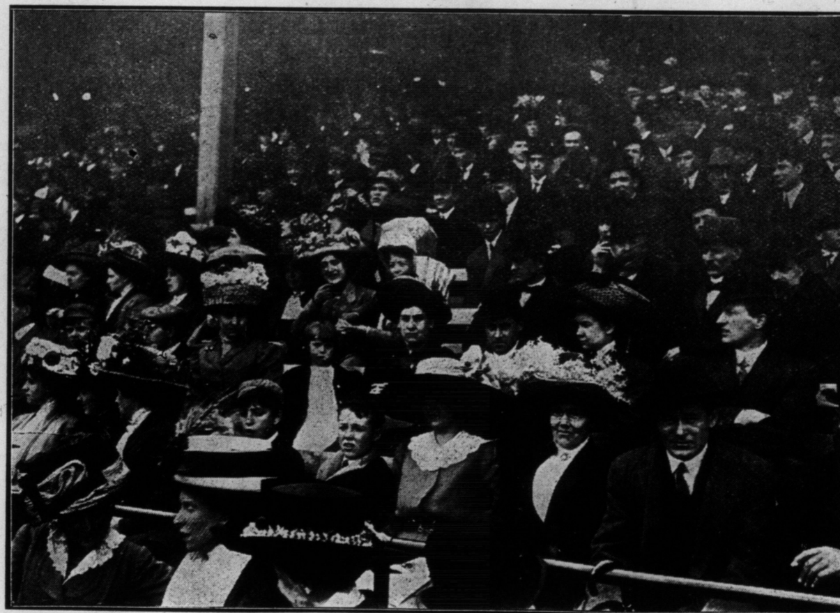
WATCHING THE HOME TEAM WIN THE GAME Interested spectators in the grand stand watching a close game between Toronto and Baltimore.