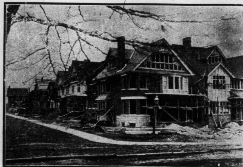
BUILDING OPERATIONS ON INDIAN ROAD. One of Toronto's new streets where many beautiful homes are being built.