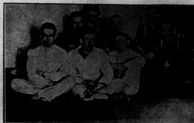
Part of orderly room and pay office staff just before retiring.