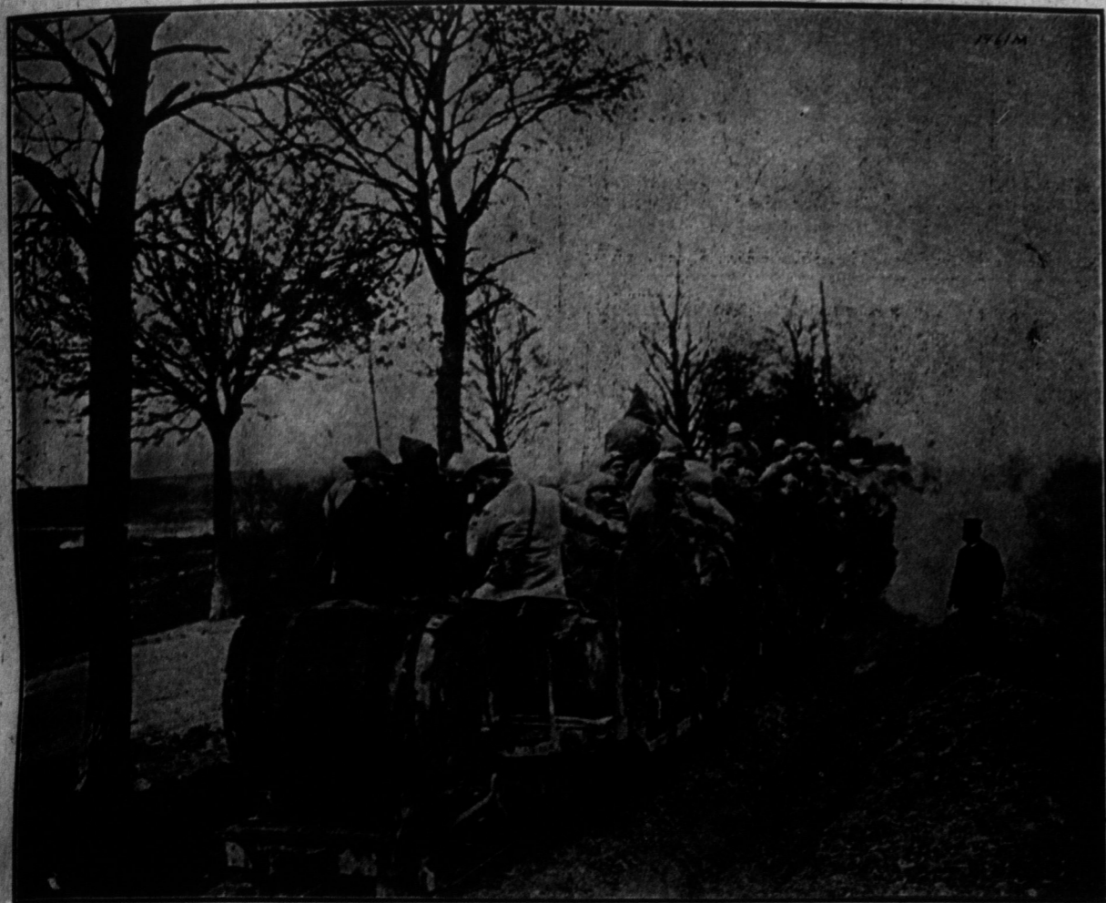
This official photograph shows a company of French soldiers being rushed to the front near Verdun on one of the miniature railways that honeycomb behind the lines.