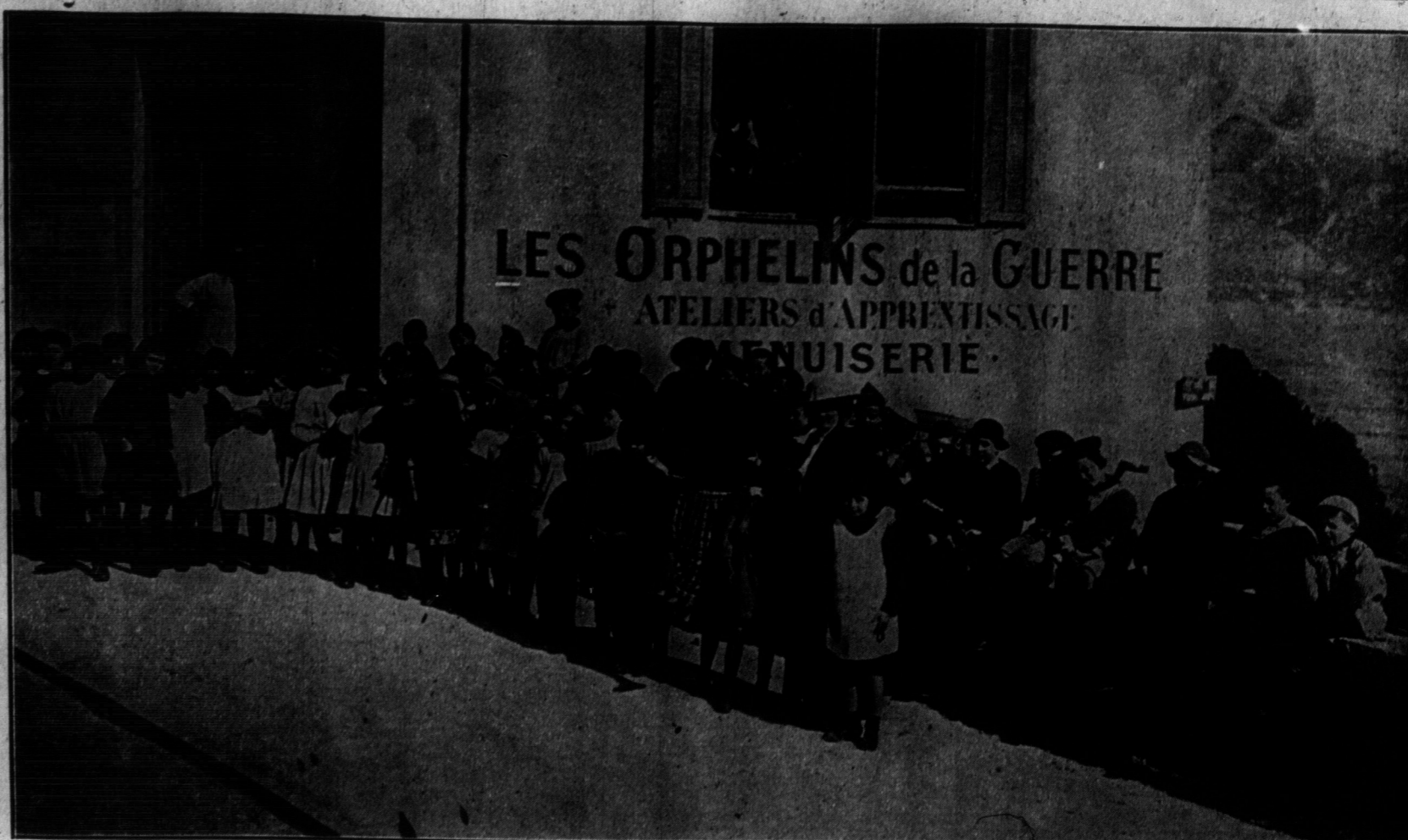
Some of the Serbian orphans which have been adopted by the French and are enjoying the care of kind matrons in the sunny south.

RIDER AGENTS WANTED In every community to ride and exhibit a sample 1916 Hyslop Bicycle. TO DAY'S TRIAL. If owner is not entirely satisfied after riding any Hyslop Bicycle 10 days it can be returned and money will be promptly refunded. TWO CENTS will cost to write to a postal and we will mail free, postpaid, catalogue and colored art folder showing complete line of bicycles, tires and supplies and particulars of most marvelous offer ever made on a bicycle. You will be satisfied at our low prices and remarkable terms. MAKE MONEY taking orders for Bicycles, Tires and Supplies. DO NOT BUY until you know what we can do for you. Write today. HYSLOP BROTHERS, Limited Dept. No. 54 TORONTO, ONT.