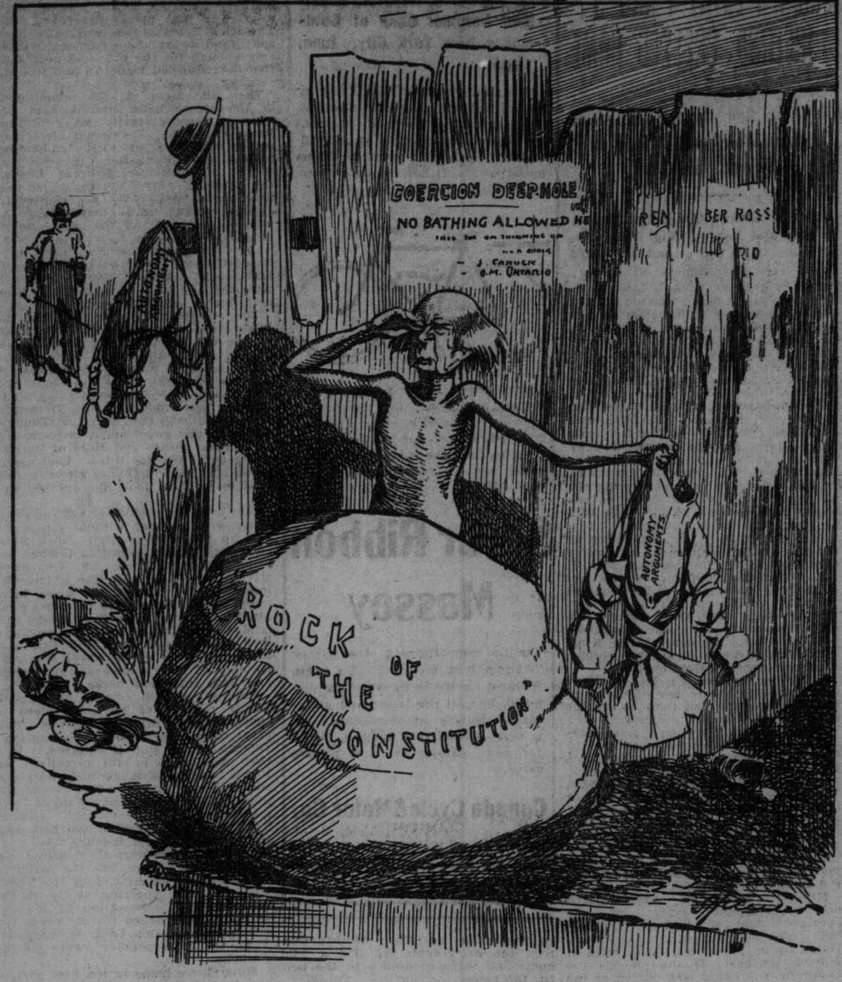
LITTLE WILFY: That's a blame nice thing for to go 'n do to a fellah's clothes, ain't it?

ment which could scarcely be in better hands, has added to the disinclina tion to force a political crisis.