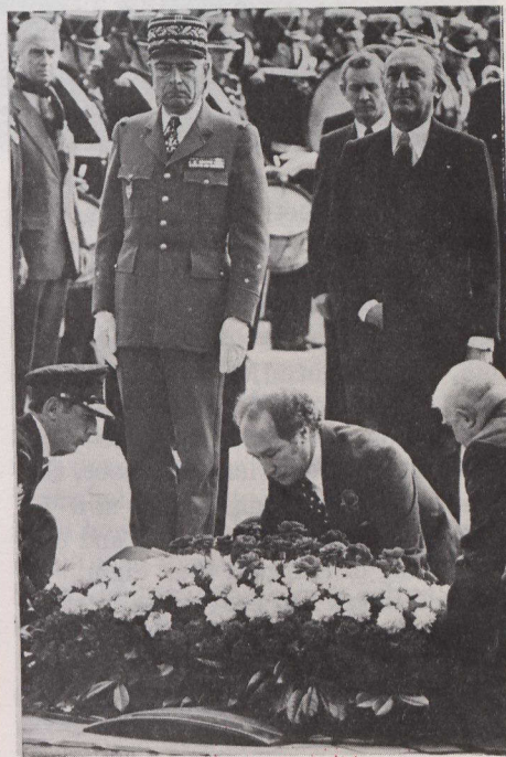
Prime Minister Trudeau laying a wreath at Tomb of Unknown Soldier in Paris.

We agreed while in Paris to launch two bilateral working groups, each with an objective of identifying areas of fruitful co-operation in order to increase and diversify our volume of trade. Each is to conclude its work in time to report to the Canada-France Joint Economic Committee at its next meeting, to be held in Ottawa in the first half of next year. One working group will concentrate on examining, without advance commitment, technological and trade investment possibilities with respect to petroleum, gas, coal and nuclear fuels, taking into account matters of interest to both sides. The other group will examine the rather broader area of trade potential in industrial sectors, and in the first instance would concentrate on the transportation industry, dealing with French interests in railways and in helicopters and with Canadian interests in STOL