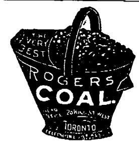
Beware of Imitations.

This chair is the Best and Cheapest ever offered to the public for solid comfort and rest, and differs from all other chairs, being a Chair, Swing and Hammock combined. It is adapted to the House, Lawn, Porch, Camp, etc., and is far superior to the ordinary Hammock in every way. Price, $3.00. Manufactured only by C. J. DANIELS & GO., 221 River Street, Toronto.