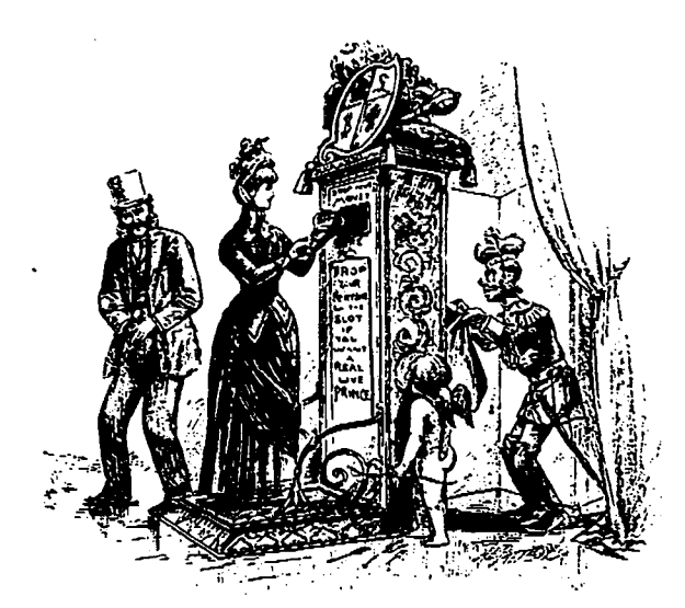
THE LATEST APPLICATION OF IT.

PALATABLE AS MILK. Scott's Emulsion is only put up in salmon color wronger. Avoid all imitations or substitutions. Sold by all Druggists at 50c. and $1.00. SCOTT & BOWNE, Belleville.