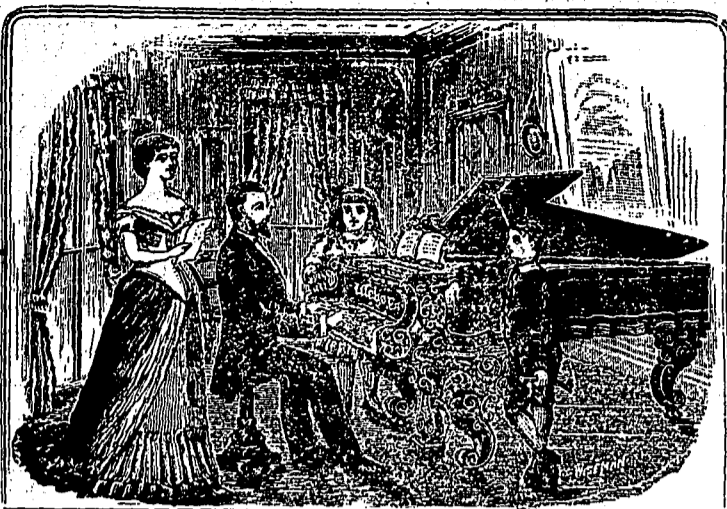
THE WEBER BABY GRAND. RECEIVED HOME.