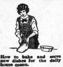
How to bake and serve new dishes for the daily home menu.