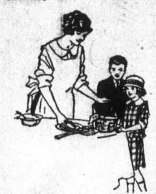
How to add new delight and wholesomeness to the children's school lunches.