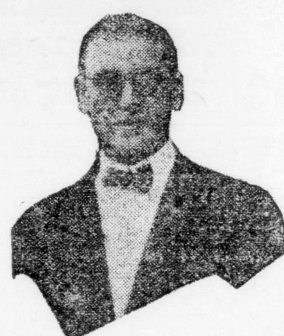
J. N. CRAWFORD, the famous all-around cricketer, playing with the Australian team. Before going to the Antipodes he captained Surrey, and was one of the best-known experts in the old country. At Montreal, Crawford made a record, taking four wickets on consecutive balls.