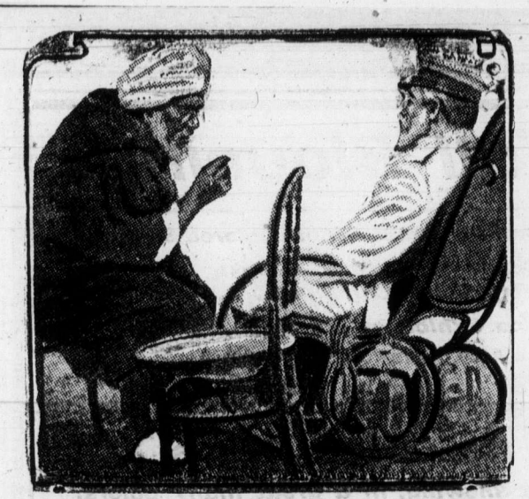
GEN. MARINAS, COMMANDER OF SPAIN'S FIGHTING TROOPS IN MOROCCO, CONFERRING WITH NATIVE CHIEF IN CAMP UNDER FLAG OF TRUCE.