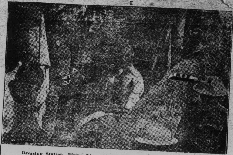
Dressing Station, Firing Line—Official Film, "Battle of the Somme."