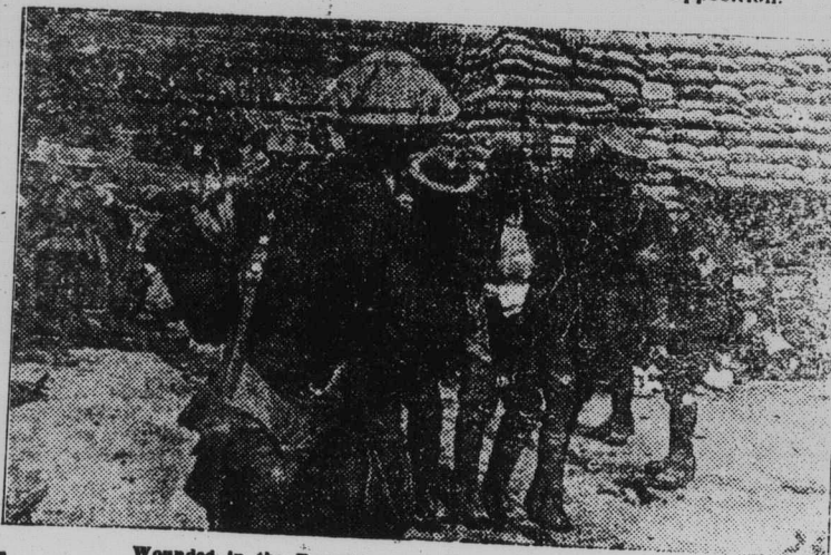
Wounded in the Trenches—Official Film, "Battle of the Somme."

MR. N. W. ROWELL, K.C., Leader of the Opposition.