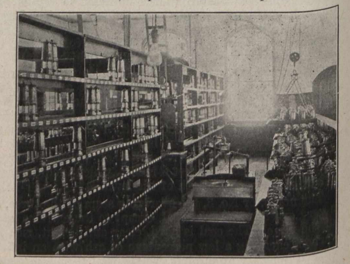
Interior of Lamp House,

To the west of No. 5 slope the level extends 5,500 feet. Horse haulage was always employed on this level to convey the coal to connect with haulage in No. 2 slope. The quantity of coal mined east and west of No. 5 is supplemented by the coal produced in No. 5 sinking. A hoist ing engine on the surface at No. 5 hoists No. 5 sinking coal to the 2,400 foot level and lands it there, whence it is hauled to No. 2 section and sent out by the rope haulage system. In the mere development of No. 5 sinking. about 500 cars of 1,800 pounds each were producer. This