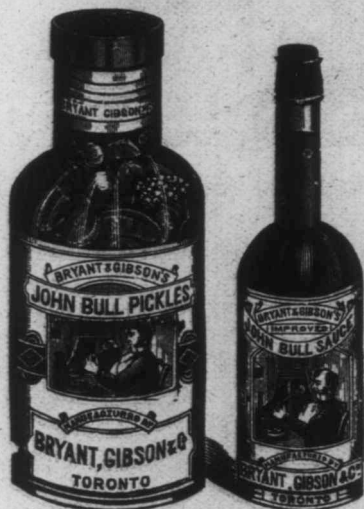
This is a facsimile of our bottles.

BRYANT, GIBSON & Co., TORONTO, Manufacturers of