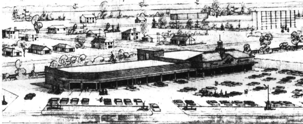
The above illustration shows a perspective of the new Lorne Park Shopping Plaza. It is being constructed on the west side of the road, north of the tracks. Ground has been cleared and work on the buildings is ready to begin. The builders, Phoenix Developments hope that the building will be ready for occupancy late this fall. The same group of developers have designed and built several smart looking plazas around Metro. They call them neighborhood plazas, aiming at the mid-week shopper.