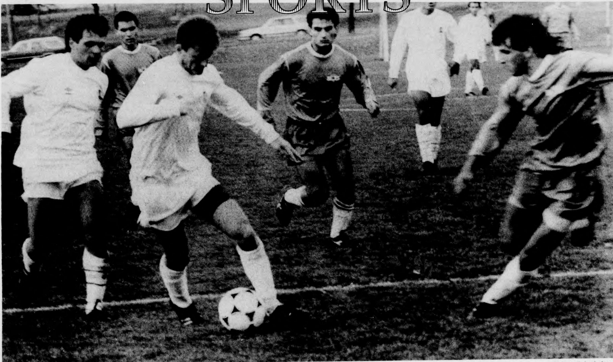
Following their second straight loss to UofT, the Yeomen were dropped to fifth place nationally, down from third spot last week.