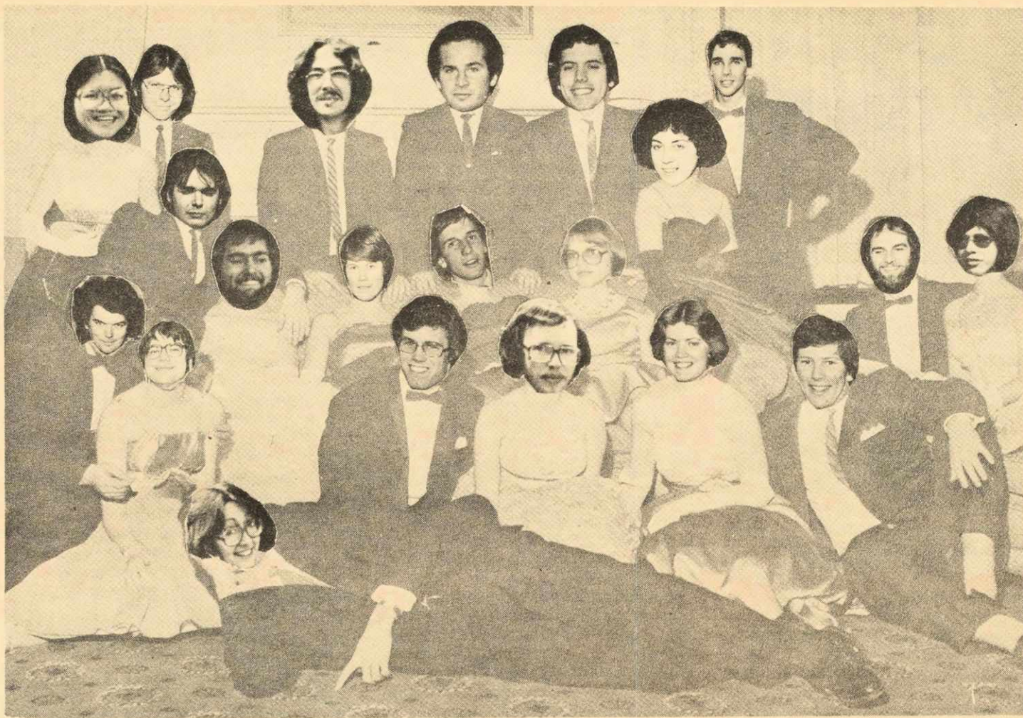
Dal Photo says goodbye too.