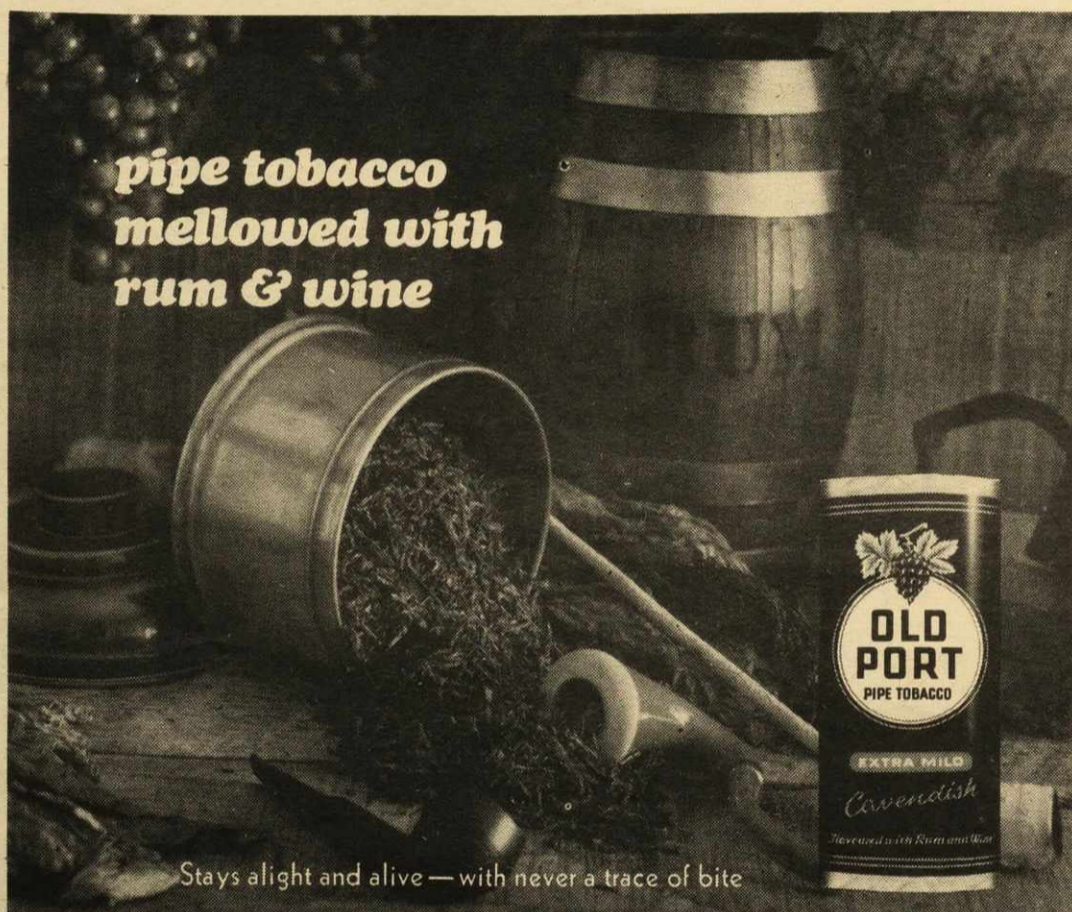
Stays alight and alive — with never a trace of bite

MISSING - N. 20 Dal Gym bicycle from inside the Campus. Anyone knowing its whereabouts: Call 422-6207