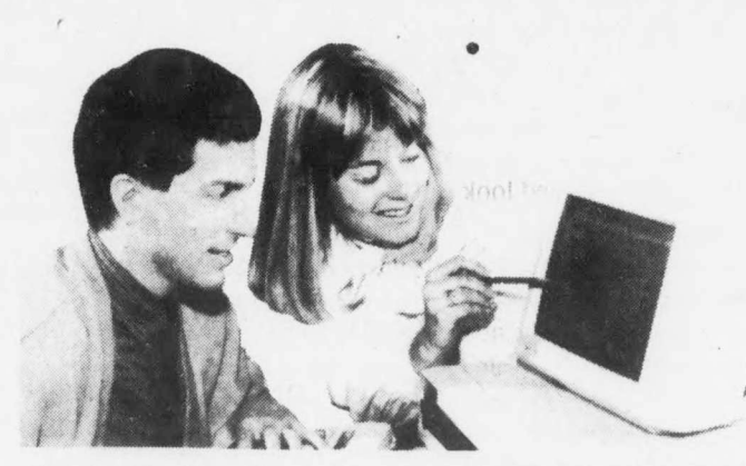
Program 90 Courses

To find out more about Canada's most innovative and fastest growing source of accounting professionals contact: CGA Atlantic Region Educational Association, P.O. Box 5100, 236 St. George Street, Moncton, N.B., E1C 8R2. Or phone (506)857-2204