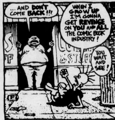
A panel from the latest Fabulous Furry Freak Brothers issue.