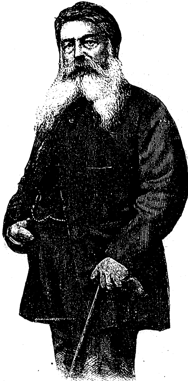
MEISSONIER, THE GREAT FRENCH PAINTER.