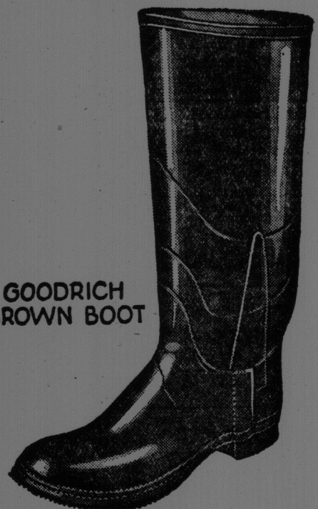
GOODRICH BROWN BOOT