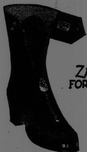
ZIPPER FOR WOMEN