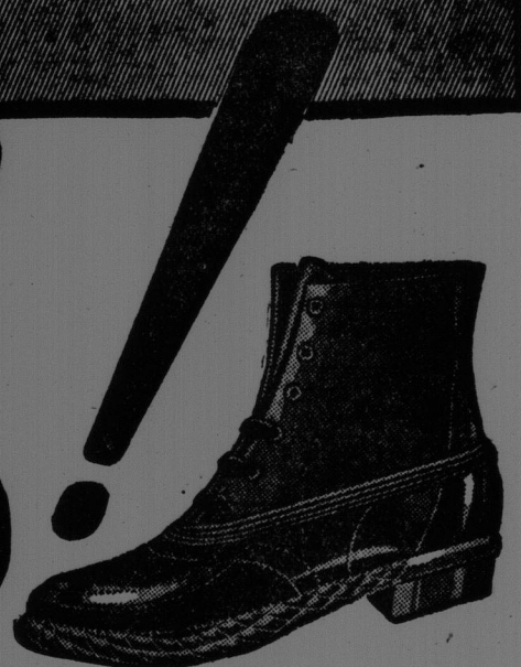
CHEYENNE GUM LUMBERMAN