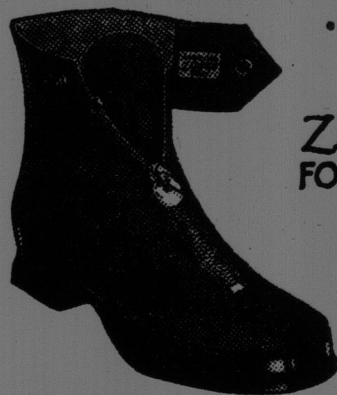
ZIPPER FOR MEN