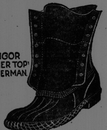
BANGOR LEATHER TOP LUMBERMAN