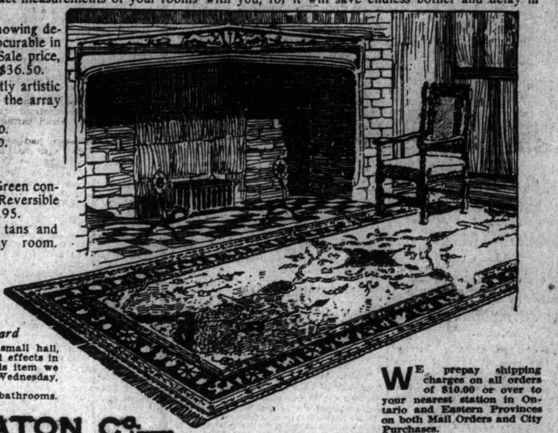
WE prepay shipping charges on all orders of $10.00 or over to your nearest station in Ontario and Eastern Provinces on both Mail Orders and City Purchases.

Remnants of Printed Linoleums in Sale Clearance at 43c Square Yard Remnants of heavy printed linoleum offer a good opportunity to cover a small hall, bathroom, sewing-room at a fraction of regular value. Blocks, floral, hardwood effects in great variety. Mostly 2 yards wide. Lengths up to 7 square yards. (For this item we cannot take phone or mail orders, the quantity being limited.) Sale price, Wednesday, square yard, 43c. English tapestry carpet, 27 inches wide, for halls, stairs, living-rooms or bathrooms. Greens and tans in good combinations. Sale price, yard, 69c. —Fourth Floor.