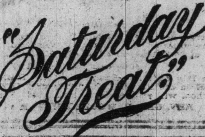
—Main and First Floor.

Greatest assortment of small size Pictures we've had for some time, and at this special price they ought to go like wild fire. In the lot are a special purchase of manufacturer's special stock, also different lines from our regular stocks, that must go owing to department alterations. Passepartouts, in large and small sizes, some with colored frames of heavy cardboard; other pictures in gilt and dark wood frames. Mottoes, character sketches, landscapes, figure heads, and dozens of other dainty ones, which present a specially attractive display. All at one price, this morning, each ..... 9c—Third Floor, Yonge Street.