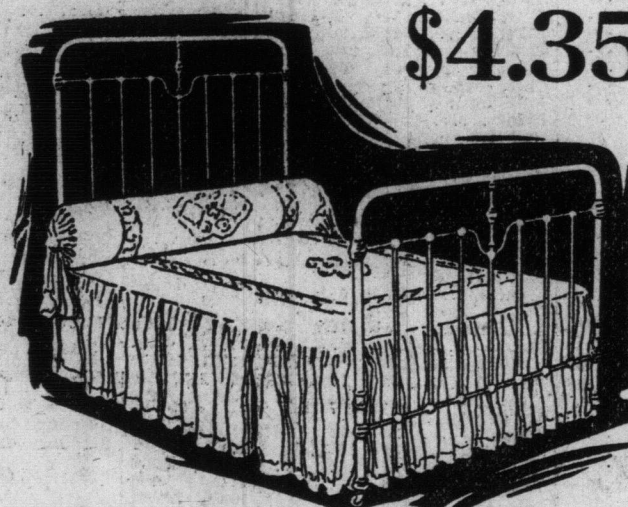
Illustration shows Iron Bedstead of good design, heavily built, with brass spindles at both head and foot end. Can be had in single size only. Regularly $6.50. Special Bedstead Sale price $4.35

Iron Bedsteads , in pure white enamel, with posts upright and filling equally strong, well-made, and very desirable. Regularly $5.75. Special Bedstead Sale price $3.85