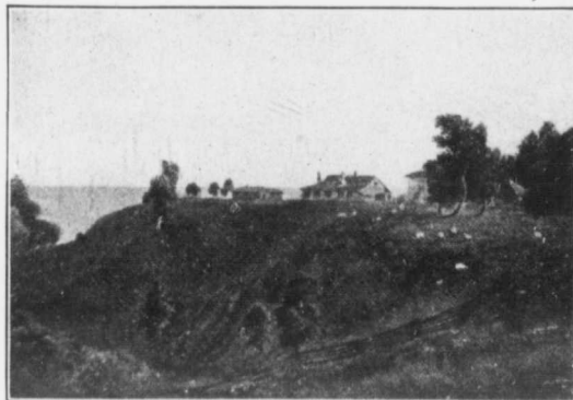
Old Port Talbot

Information of the fullest kind may be had on application to the Clerk of the Township of Dunwich, Dutton, Ont.