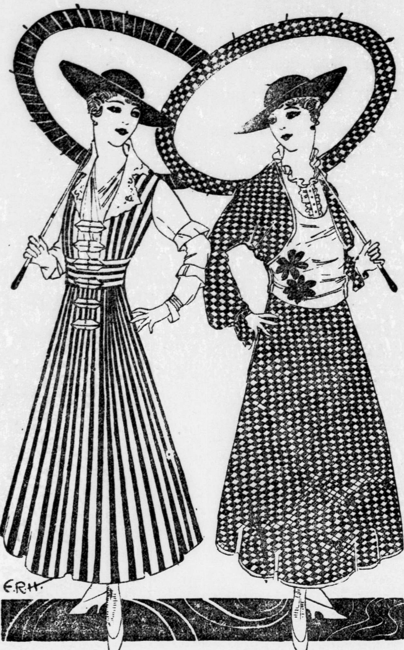
Don't Wear a Dress Like This—But Wear a Dress Like This.