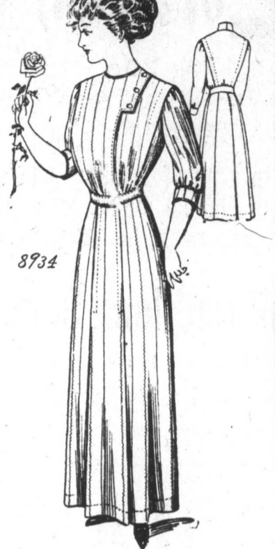
Ladies' House Dress with Seven Gore Skirt.

This design will appeal to every home dressmaker who appreciates simplicity and style. The waist has a shaped side closing, and the skirt is cut with the popular inverted back plait and has a deep tuck at each seam of the front gore. The sleeve may be finished in full length or as a shorter sleeve. The pattern is cut in 5 sizes: 32, 34, 36, 38, 40 and 42 inches bust measure. It requires 7 yards of 36 inch material for the 36 inch size. A pattern of this illustration mailed to any address on receipt of 10c. in silver or stamps.