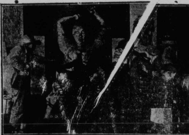
WILLIAM DUNCAN In a big scene in Vitagraph's Super Serial "THE MAN OF MIGHT"

The opening chapter of the most stupendous serial yet produced to date, featuring the world's favorite serial king