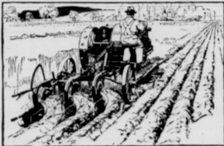
From an actual photograph of a Case 10-20

When you come to reason it out, it is natural that a concern like the Case Company, founded in 1842, should take first rank. For back of each Case tractor lies tradition, history and valued reputation—worth millions. Each tractor is made to add to this world-wide reputation. We built our first tractor 24 years ago and have since spent hundreds of thousands in perfecting it. We do all the experimenting before placing our tractors on the market. We could not afford to put forth an experimental machine.