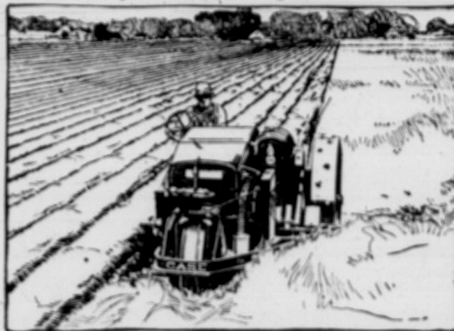
From an actual photograph of a Case 10-20

The Sign of Mechanical Excellence the World Over