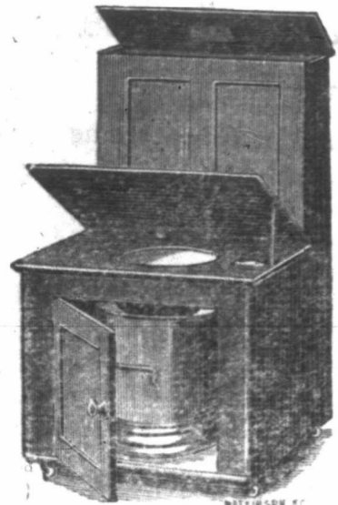
Pull-up Handle Commode.

These Closets can be fitted up indoors, or out, being perfectly innocuous.