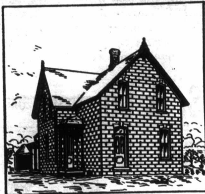
Concrete Residence of W. H. Fry, Fenwick, Ont. Size of Building, 28 x 32 x 18 feet high. BUILT WITH THOROLD CEMENT IN 1877.