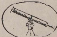
Registered Trade Mark.

Locks in all qualities for Cabinet Makers, Sash Fasteners, Locks & Brassfoundry for Builders' Ironmonger. ALL KINDS OF KEYS MADE on the PREMISES.