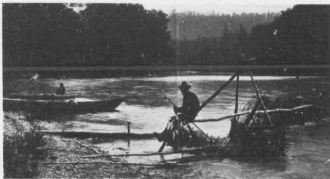
An Indian Fishtrap

TO those who enjoy hunting and fishing no locality can offer better advantages. A few days outing in the mountains brings one in contact with Bear, both black and grizzly, Mountain Goats, Mountain Sheep and Deer. In the immediate locality, in the woods and on the