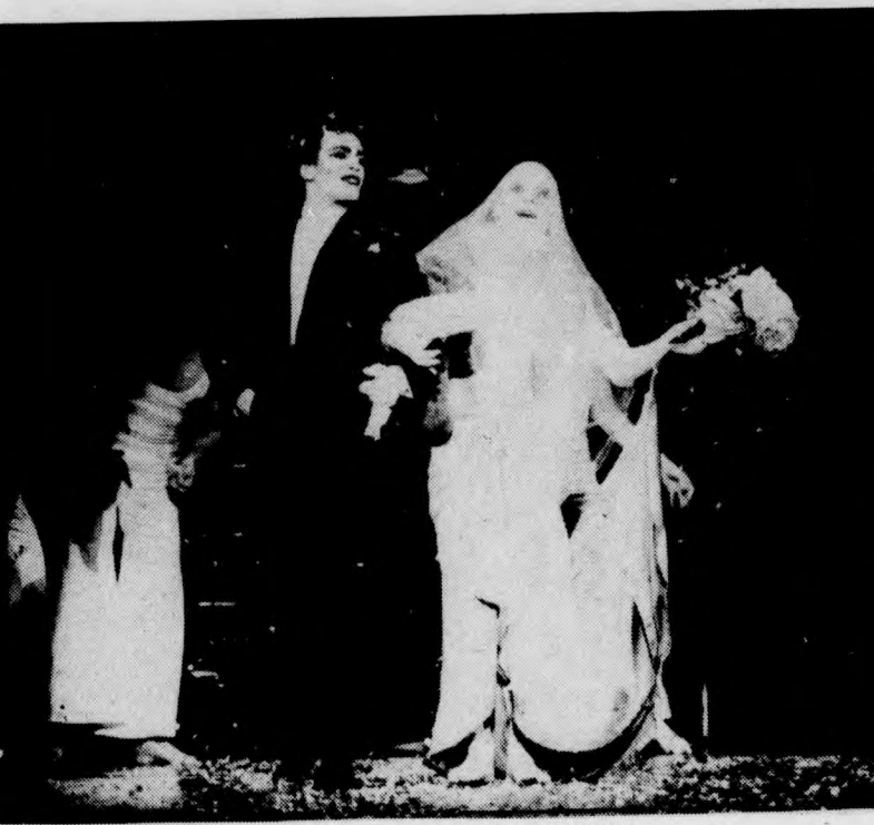
Flowers leaves you groping for words

symbol — hazy hues depicting life's "fantasy and sordidness". The dark themes of evil and moral decadence dominate with religion providing the disturbing alternative.