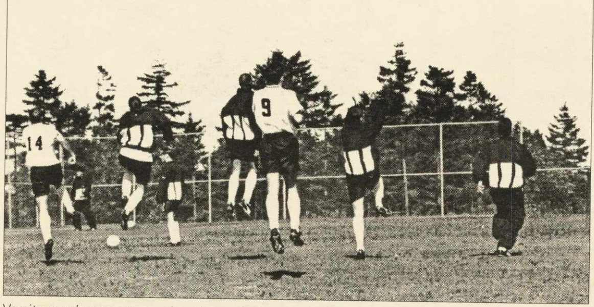
Varsity men's soccer - an elevating experience

On Campus and around the City... Sept. 28 - Oct. 5, 1995