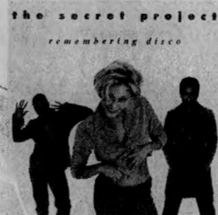
THE SECRET PROJECT REMEMBERING DISCO

"Silly" would be the best word to use to describe this CD. The cover and the title had me expecting it to be a combination of '90s dance and '70s disco. Well, not quite. I did immensely enjoy the first and last songs on the CD. They had me doing a little jig around my room. However, the songs sandwiched in between were pretty awful. A couple of '80's sounding songs, a couple of "somewhat disco-like songs," and a Bobby Brown style love song do not a good CD make. Back in '86 when I had really big blonde hair, blue eye shadow and acid wash jeans I would have loved this CD but now it just makes me laugh at a forgotten era. If you are the kind of person who holds onto the past musically, pick it up. If you aren't, throw on a flannel shirt and pick up Sheryl Crow's new CD instead.