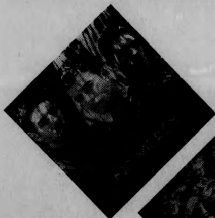
NO MERCY MY PROMISE