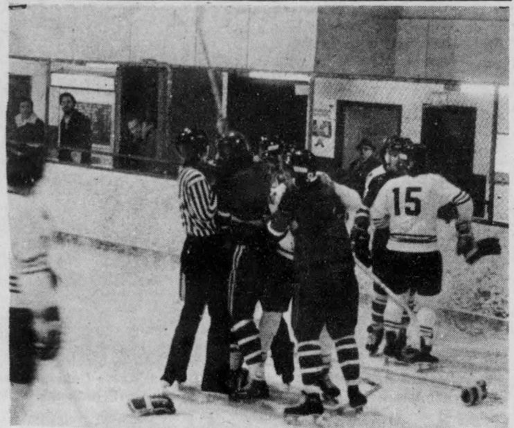
The Red Devils finally won a few games last weekend as they beat the MUN Beothuks 8-6, 10-8.