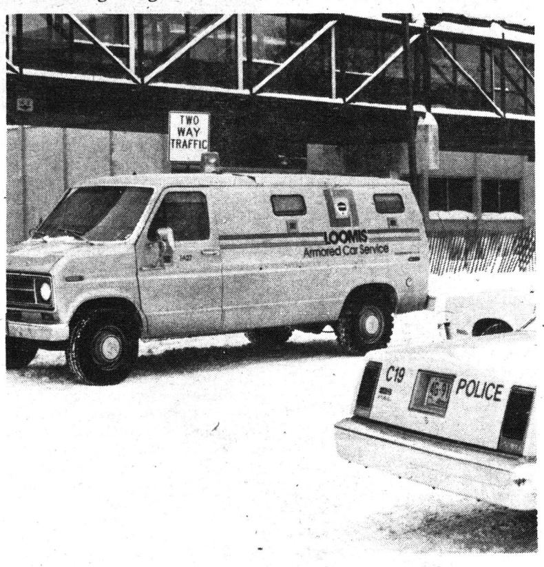
The truck knocked over in the big heist

Anyone having information about the robbery is urged to contact Campus Security at 432-5252. Confidentiality will be maintained.