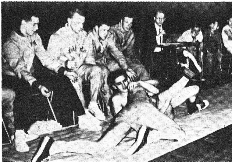
WAY DOWN LOW